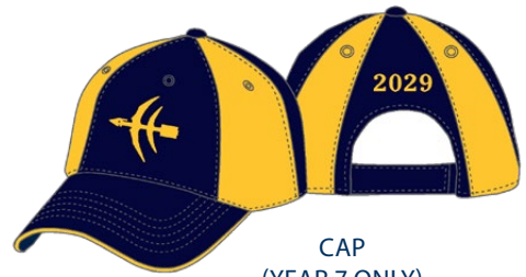
CAP (YEAR 7 ONLY)