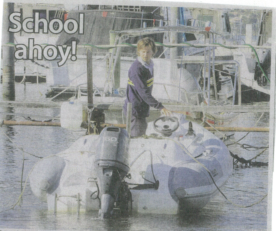
Captain Jack Swallow arrives at Claremont Yacht Club ready to for another day at school.