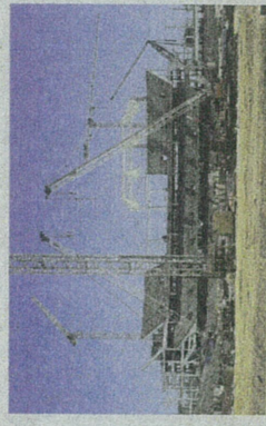
Going up: The stadium this week.

Bidders were judged on their overall delivery approach; operational performance; their plan to manage interactions with other parties including the