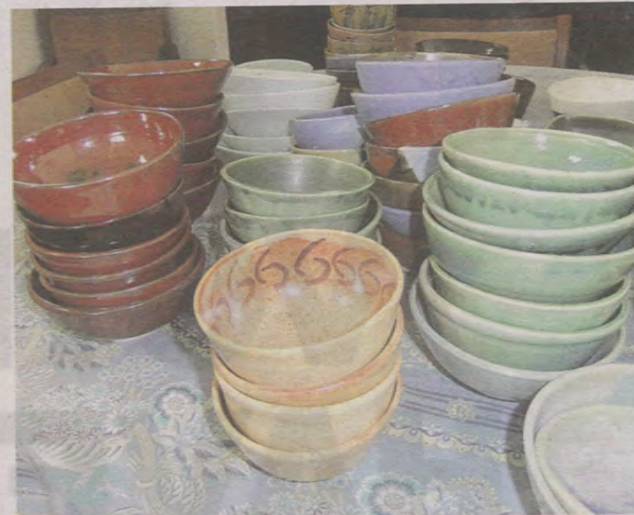
Donated bowls will be filled with soup for the lunch at Christ Church Grammar School.