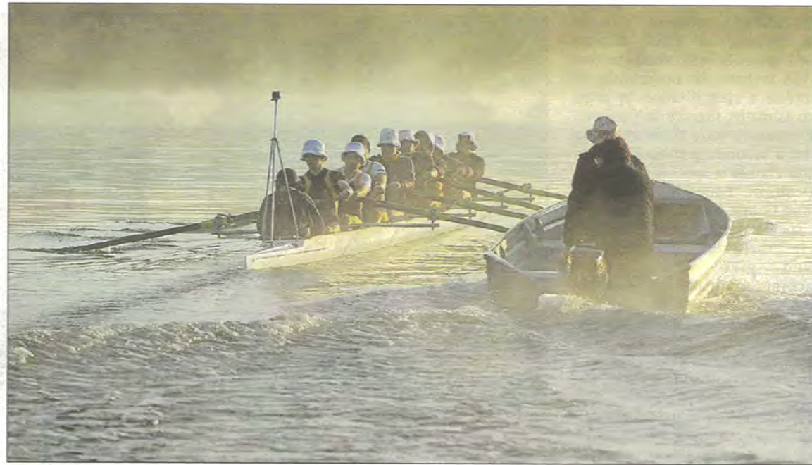
Christ Church Grammar School's residential community provides a safe, secure boarding experience offering excellent academic support.

Residential staff assist with boys enjoying dinners and socials with our neighbouring girls' schools, and boys are encouraged to participate in outside sporting clubs