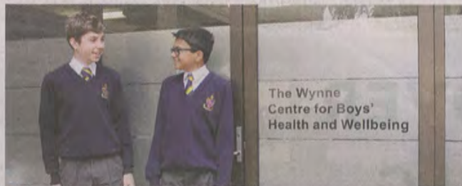
■ The Wynne Centre at Christ Church supports the school's program promoting wellbeing.