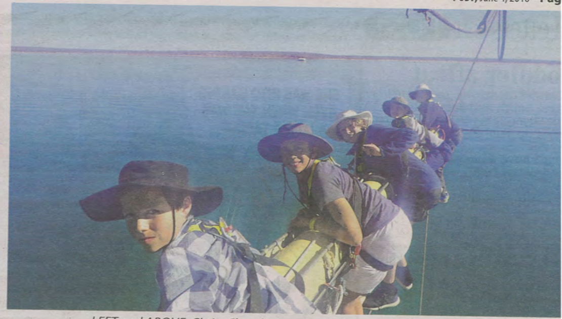
LEFT and ABOVE: Christ Church Grammar School students man the sails.