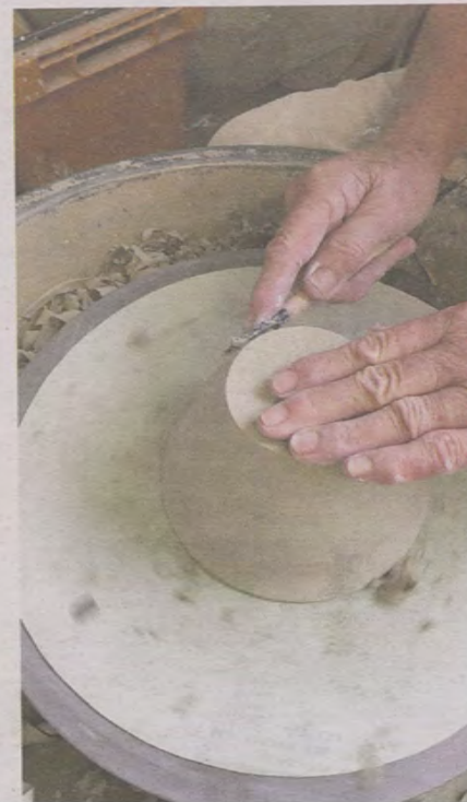
LEFT: Empty Bowls Perth is a fundraiser for Foodbank, which supports a breakfast program for WA schoolchildren.