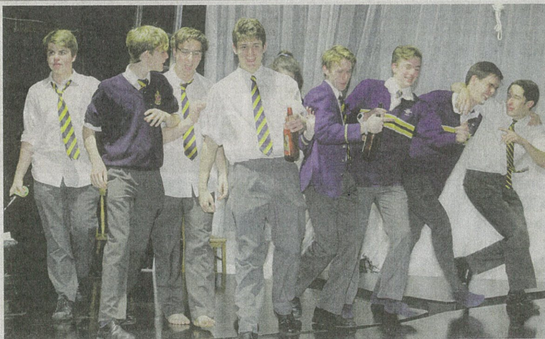
Christ Church Grammar School students get into the spirit rehearsing Cloudstreet.