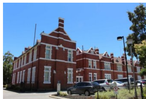
PHOTO: Perth Modern School, in Subiaco, has topped the ATAR league tables this year.

There were 16 public schools and 34 private in the top 50, a 33 per cent jump on last year when public schools made up 12 of the top 50.