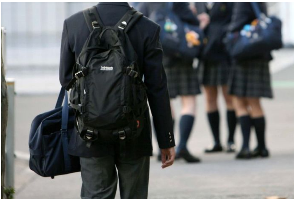
PHOTO: School rankings are only one measure of a school's performance, experts caution.

The mean ATAR result across all schools was 77.5.