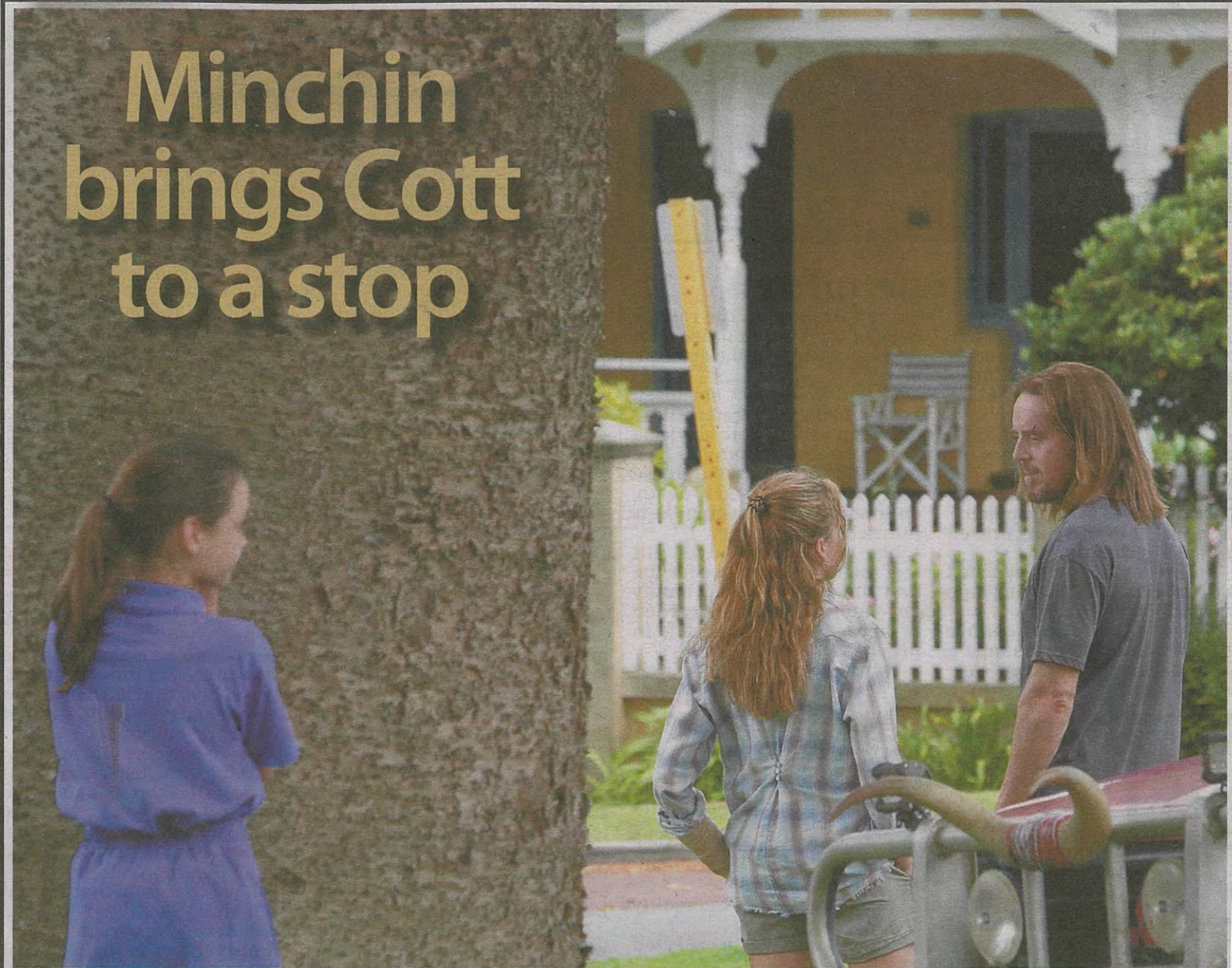
Stage fright... A North Cottesloe Primary School student peeks at Tim Minchin and co-star Milly Alcock on the Broome Street set of Upright on Wednesday morning.