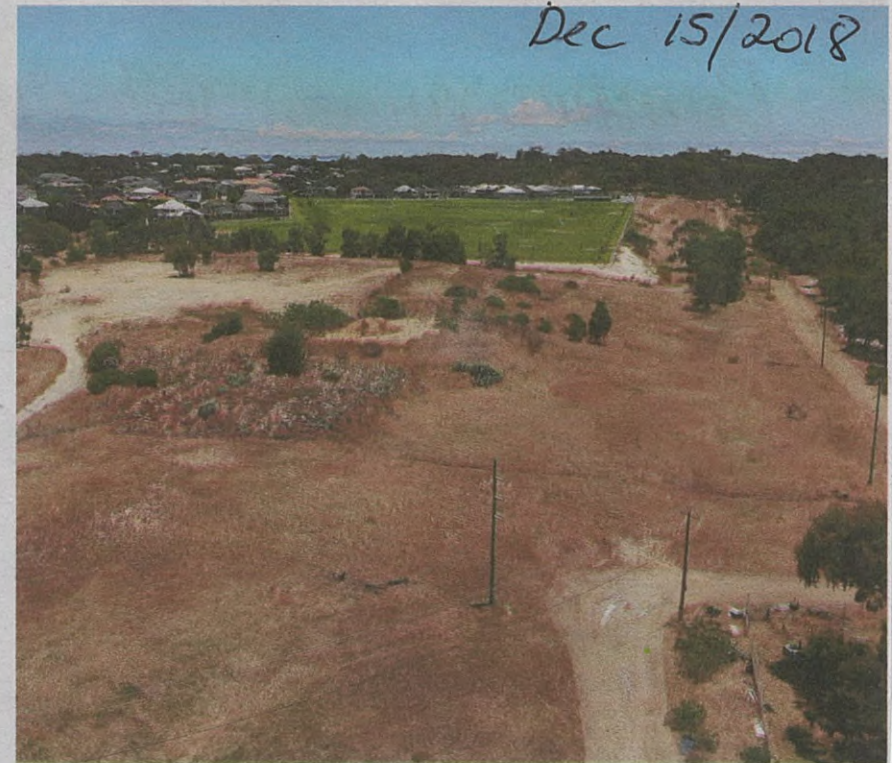
Christ Church Grammar School wants to turn this former landfill site into playing fields.

Councillors voted not to endorse Christ Church's proposal in committee, but will make their final decision on December 18.