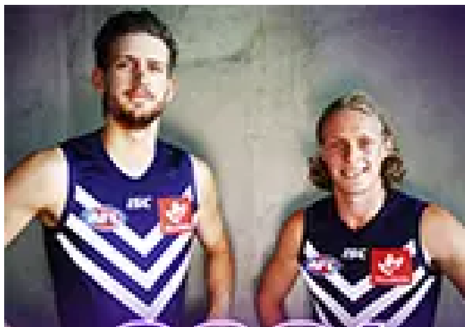
Young duo sign on