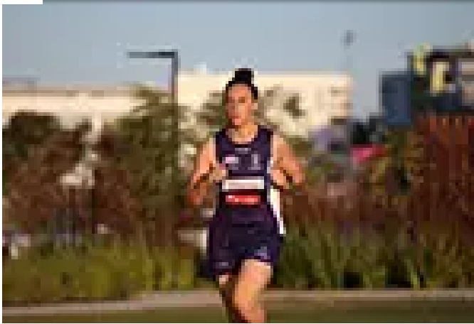
AFLW Team: Atkins confirmed for return